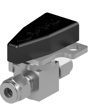
WARNING To be used with padlock shackle diameters of 1/4" to 5/16" only.

If the valve is disconnected form a system for installation, it must be depressurized, cycled, and purged.