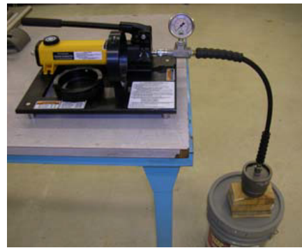
Swaging Head Positioned Below Pump